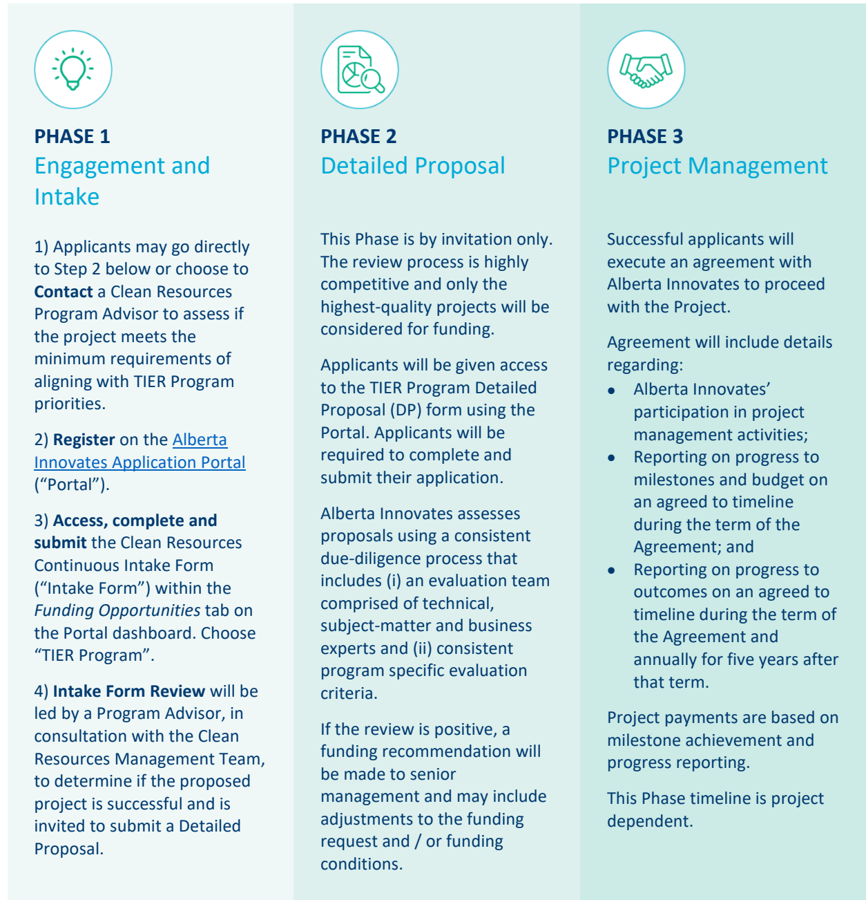
Figure 3: Continuous Intake Application Review and Management Process

The TIER Program will require applicants to use the Clean Resources “continuous intake” application and management process – this process is delivered in three phases. Project applications will be reviewed on their merit and the potential for impacts aligned with TIER Program, Clean Resources Program focus areas, strategic priorities, and contribution towards 2030 Innovation Targets. Figure 3 below highlights the three phases of the Process. For more information on the application process and evaluation criteria, refer to the TIER Program Application Guide (“Application Guide”).