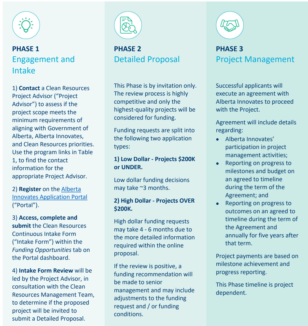
Figure 3: Continuous Intake Application Review and Management Process

The continuous intake application and management process is delivered in three phases. Project applications will be reviewed on their merit and the potential for impacts aligned with program focus areas, strategic priorities, and contribution towards 2030 Innovation Targets. Figure 3 below highlights the three phases of the Process. For more information on the application process and evaluation criteria refer to the Clean Resources Application Guide: Continuous Intake Process (“Application Guide”).