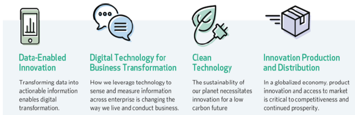
Figure 2: Alberta Innovates Emerging Technology Strategic Focus Areas